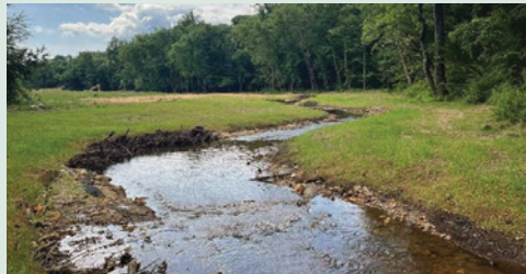
Hodges Creek, Surry Co., NC Resource Institute is working with Surry Soil & Water Conservation District, NC Division of Water Resource and NRCS to establish a riparian buffer and install cattle crossings in this reach of the stream.

Almost 39,360 linear feet of stream will be enhanced and restored.