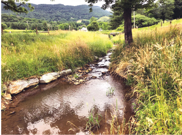
Linville Creek stream restoration project after instream construction and planting the riparian buffer.