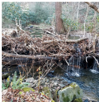
BEFORE: Unstable reach of UT to Squirrel Creek prior to restoration.