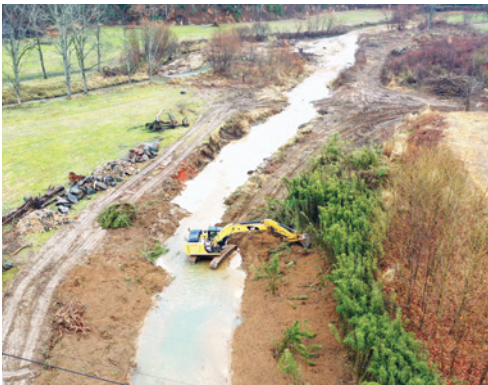
This aerial drone photo shows instream construction along Paint Fork, California Creek, and Little Ivey Creek.