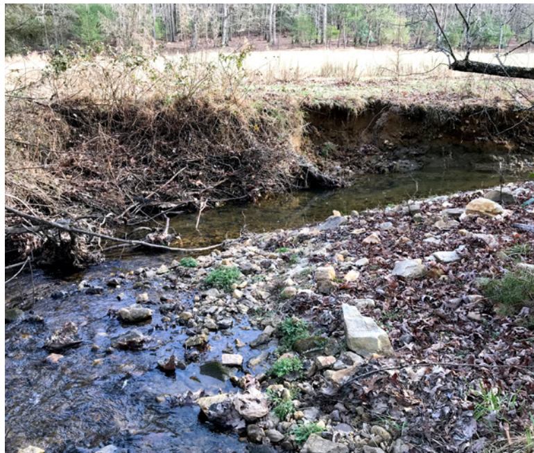
BEFORE: Prior to restoration UT Little Fisher Creek's streambanks were high, unstable, and eroding.