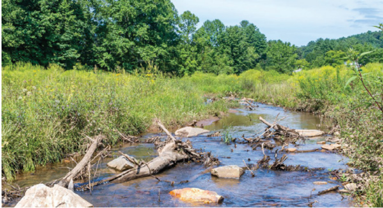
AFTER: Bates Branch post-restoration with instream structures to stabilize streambanks and new riparian buffer.

Establish a riparian buffer, remove invasive plant species and reestablish native plants, trees, and shrubs.