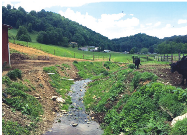
BEFORE: Linville Creek lacked stream crossings contributing to streambank and streambed erosion.