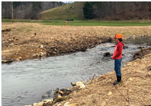
Paint Fork and California Creek as they flow into Little Ivey Creek just after instream construction.