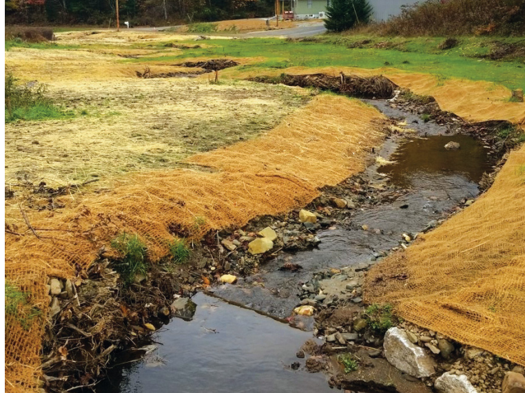
UT to Squirrel Creek post-restoration with stabilized streambanks and reconnected floodplain