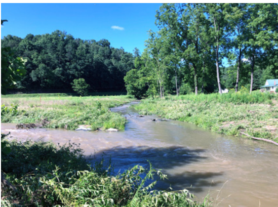
Paint Fork and California Creek as they flow into Little Ivey Creek after riparian planting