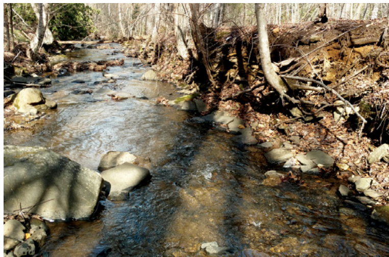
Prior to restoration streambanks on Squirrel Creek were steep and severely eroded.