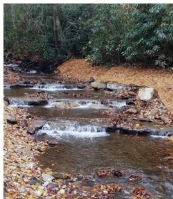
AFTER: A view of the instream structures installed on UT to Squirrel Creek. The instream structures reduce erosion and help stabilize the streambanks.