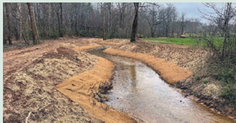
Pounding Mill Creek, Cleveland Co., NC This stream flows into Knob Creek, a past Resource Institute project. On this section, RI will reduce the bank height ratio and create a bankfull bench.