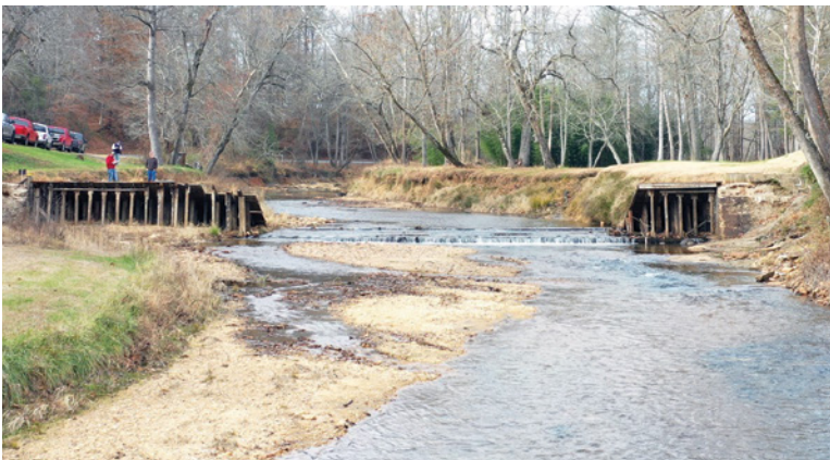
BEFORE: Hurricane Michael dropped more than 10 inches of rain on Surry County. This resulted in the destruction of the historic Kapps Mill dam. The blowout flooded the Mitchell with tons of fine sediment and caused extensive erosion.