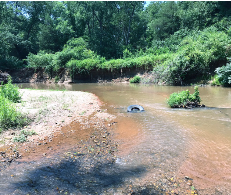
BEFORE: Prior to restoration, severe erosion on Big Elkin Creek created an incised channel with no access to a floodplain.