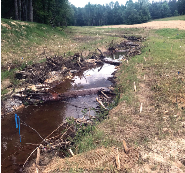
The project team installed instream stream structures and planted a riparian buffer to stabilize UT Little Fisher Creek