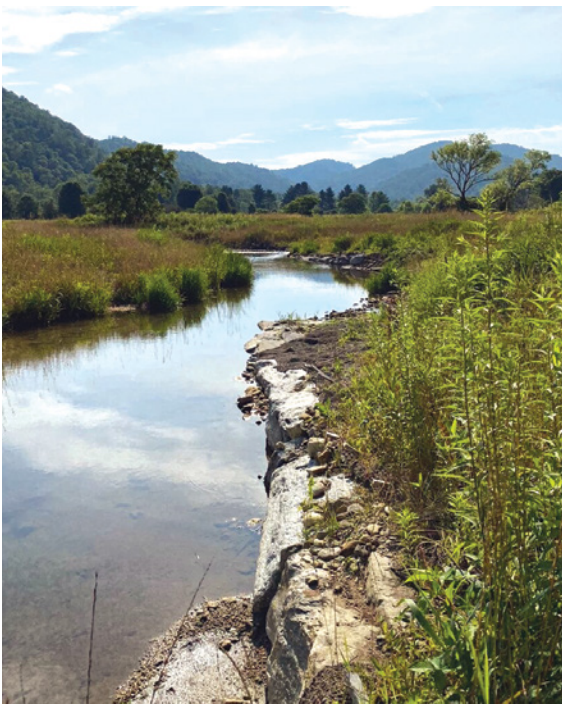
Dutch Creek restoration project just after establishing the riparian buffer.

BEFORE: Prior to restoration, Dutch Creek was actively migrating and lacked proper dimension, pattern, and profile, as well as riparian buffer and aquatic habitat.