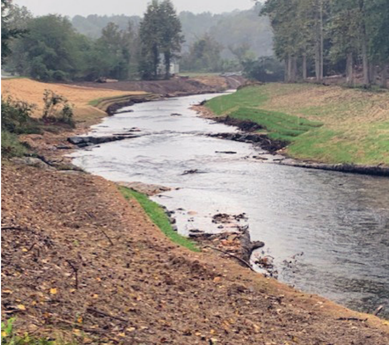
This photo is looking upstream from the old dam post-construction and prior to riparian buffer planting.