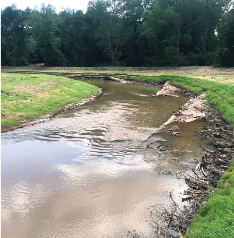
The project team constructed rock and woody structures and planted a riparian buffer to stabilize Big Elkin Creek.

Establish a riparian buffer, remove invasive plant species and reestablish native plants, trees, and shrubs.