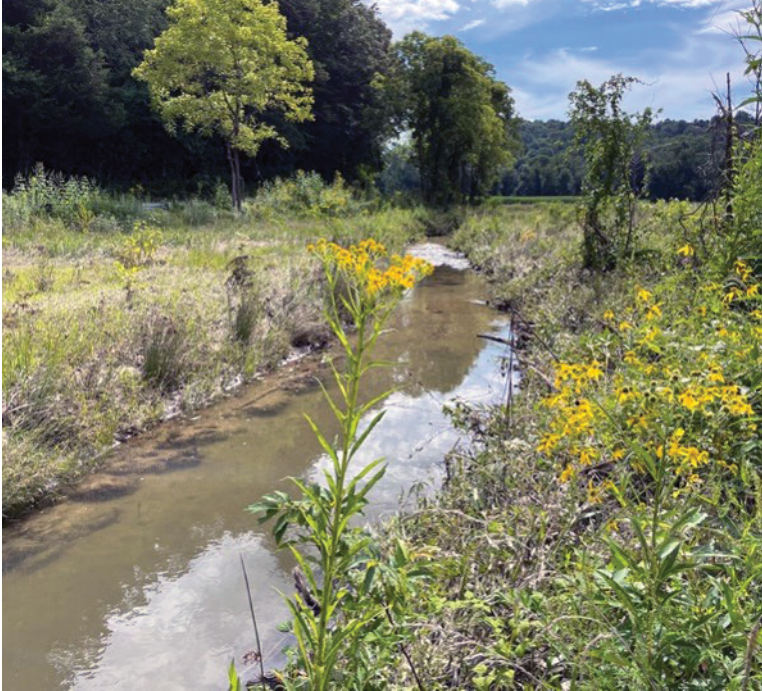
AFTER: The project team constructed in-stream structures, used bioengineering techniques, and planted a riparian buffer. The team also worked with landowners to restrict livestock access to the stream.

Install fencing to restrict livestock access to the stream corridor to protect streambanks and streambank vegetation.