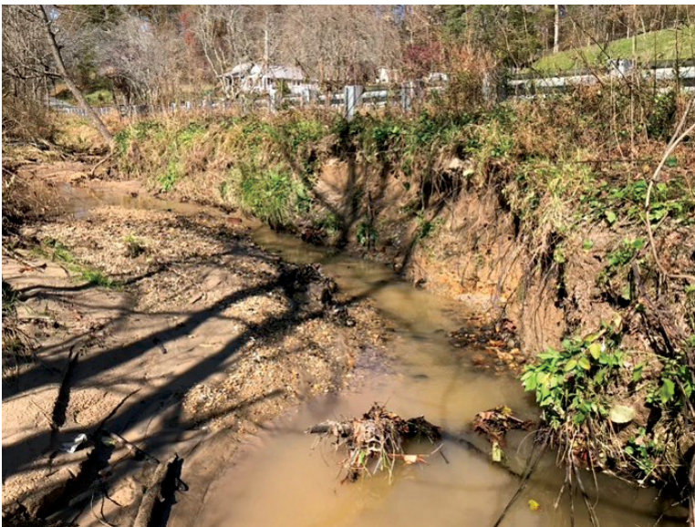
BEFORE: Steep, unstable streambanks on Foster Creek prior to restoration.