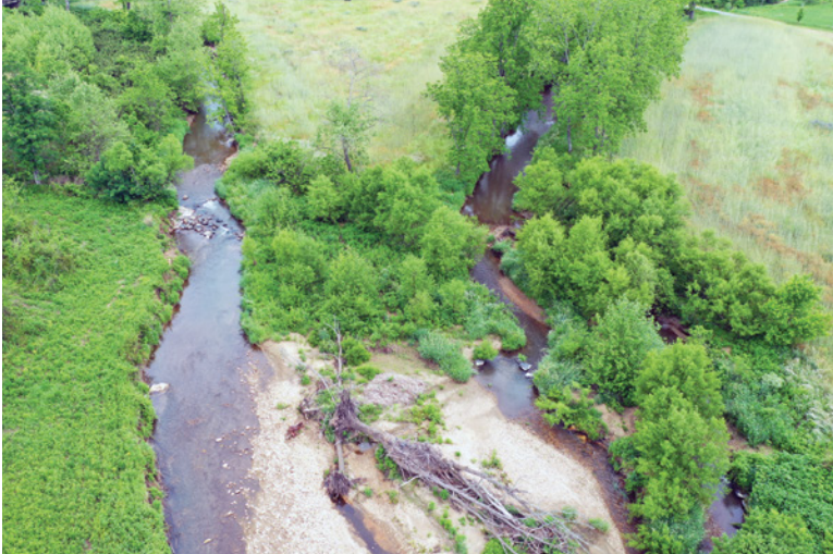
This aerial drone photo shows degradation to Paint Fork, California Creek, and Little Ivey Creek prior to restoration.