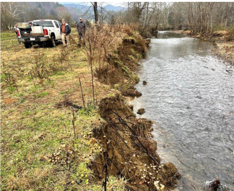
BEFORE: Before restoration, this section of the Valley River was transporting excess sediment and nutrients. The steep streambanks were eroding and it lacked a riparian buffer.