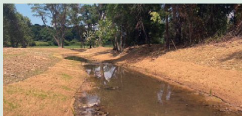
UT Second Broad, Rutherford Co., NC RI will restore a 2,700 feet section of this stream, including establishing a riparian buffer and installing stream crossings for cattle.