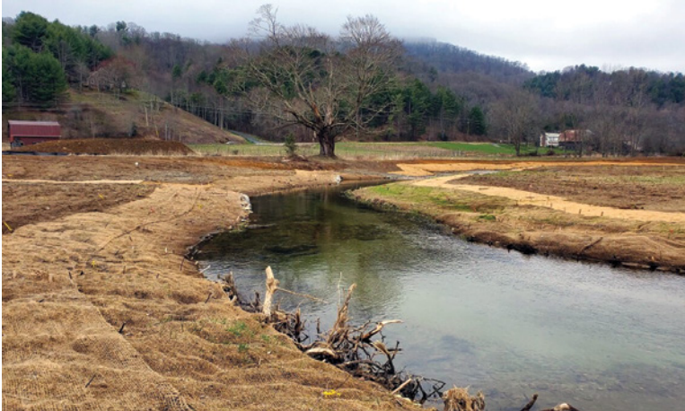
Dutch Creek stream restoration project after instream construction and just before planting the riparian buffer.

Establish a riparian buffer, remove invasive plant species and reestablish native plants, trees, and shrubs.