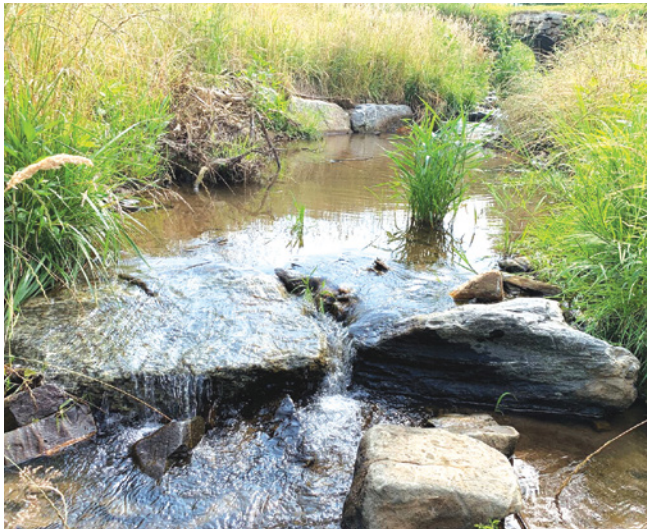
Instream structures constructed for the Linville Creek restoration project.