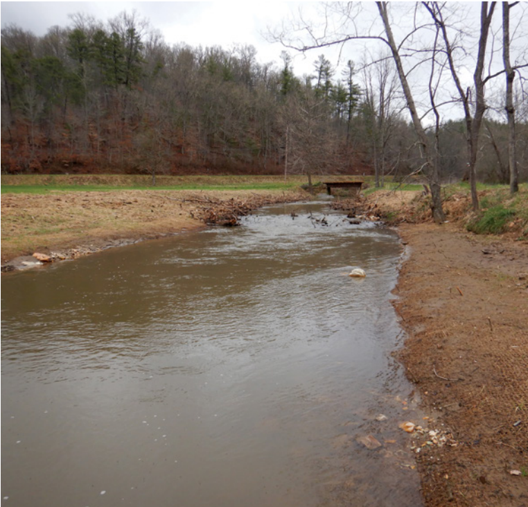
AFTER: The project partners restored this section of the Valley River by regrading the streambanks, creating a bankfull bench, planting a riparian buffer, and excluding livestock from the stream.