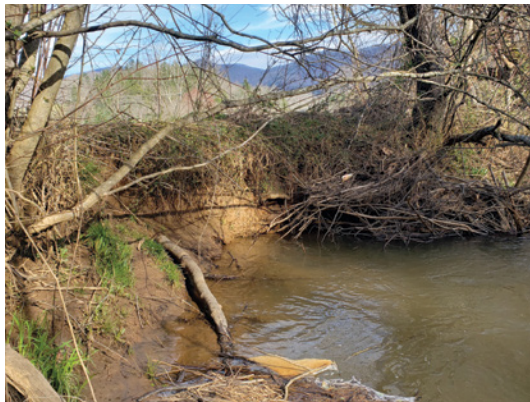
BEFORE: Prior to restoration, Bates Branch and Hog Lot Branch had high, unstable streambanks that were severely eroding.